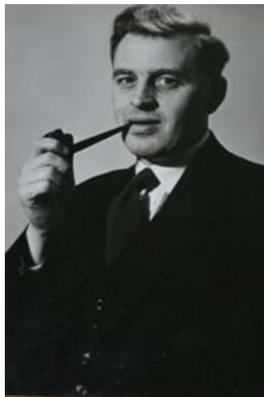
An early attempt at giving up cigarettes