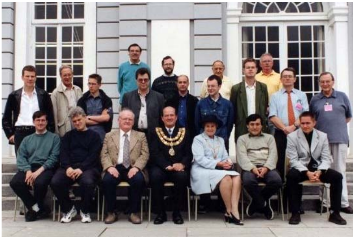
The group of players at the Golombek Memorial.