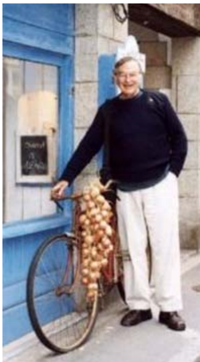
On holiday in Brittany in 2003

He was a great bibliophile, with a large collection covering history, politics, science, languages, mathematics, but particularly chess. He had several hundred chess books and a large number of ornamental sets and boards, and these were beautifully laid out in his new house in Boxgrove.